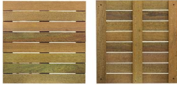
24" X 24" (Actual 23-7/8" x 23-7/8")