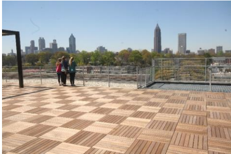
Panels in Mosaic Application