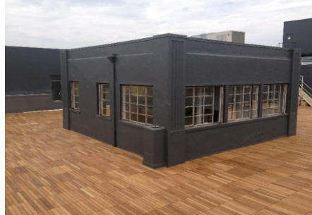
Panels in Linear Application