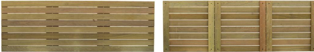
24" X 72" (Actual 23-7/8" x 71-7/8")