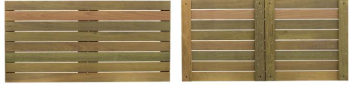
24" X 48" (Actual 23-7/8" x 47-7/8")