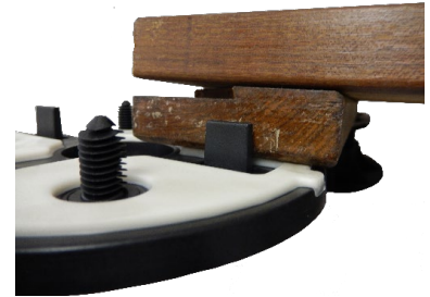
Deck Tile / Pedestal Connection Detail