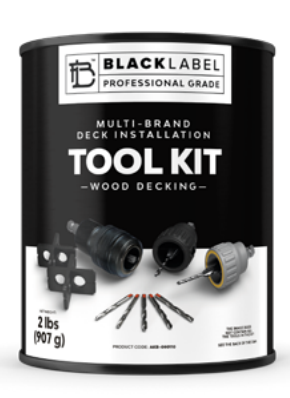
1 gallon - 2 lbs (907 g)