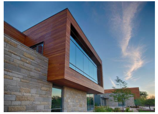
Left: Cedar Weathered / Middle: Cedar weathered / Right: Garapa finished with natural oil.