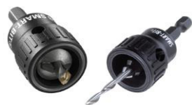
TFP PRODECK Pro-Plug Smart Bit