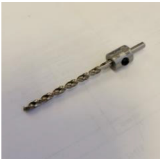
Fast Spiral Jobber Bit