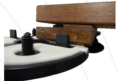
Deck Tile / Pedestal Connection Detail