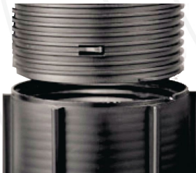
Max Height Locking Mechanism