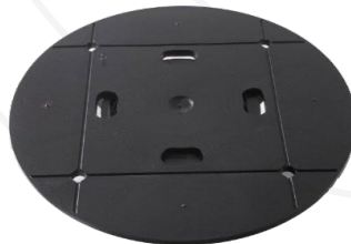
Pedestal Base Scoring