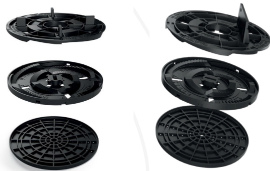
Star T with Star B Stackable Base and Joist Head Option

TFP ProDeck Star Pedestals provide a unique solution when your project requires pedestals under 1-1/4" with some adjustability to allow for some irregularity in the base surface.